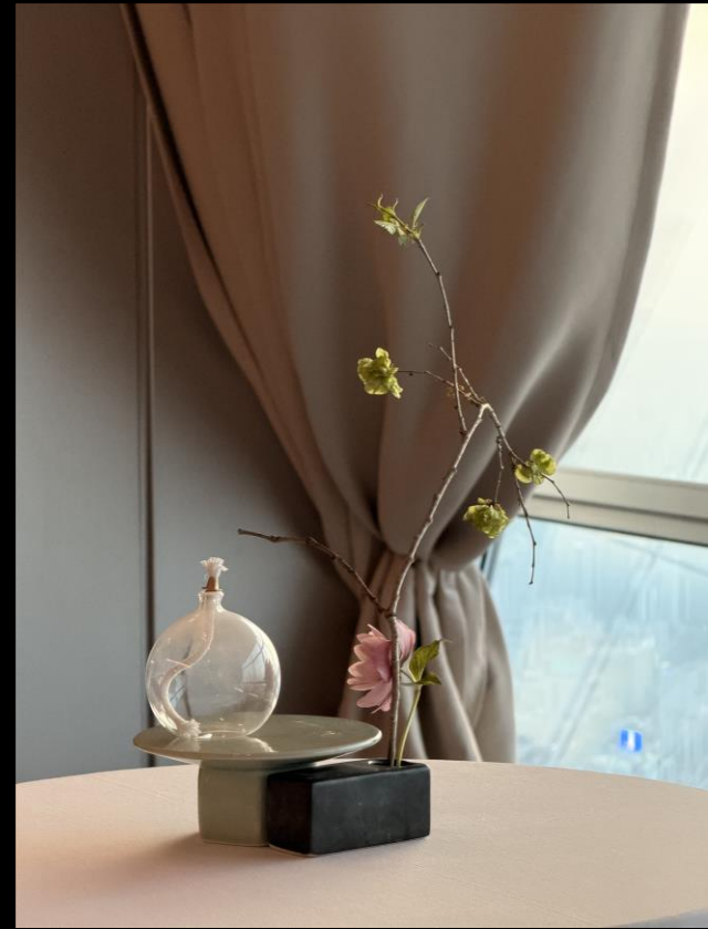
Spring Decoration with Cherry Blossom