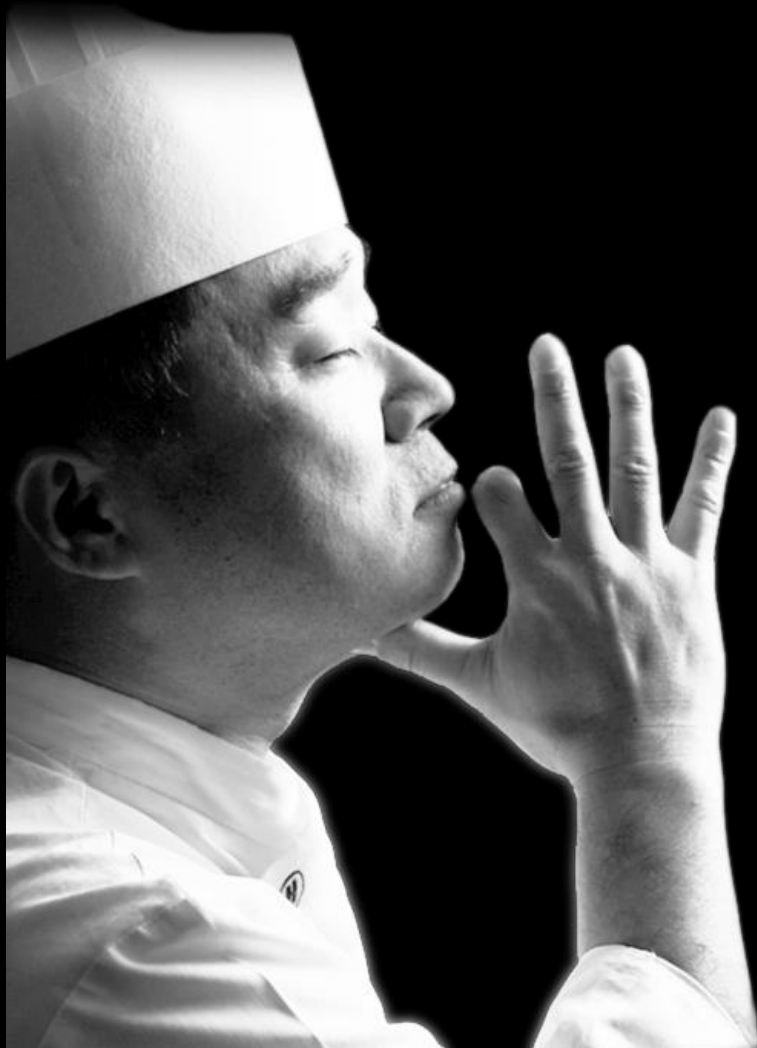
Seasonal tasting menus rooted in Korean Gastronomy