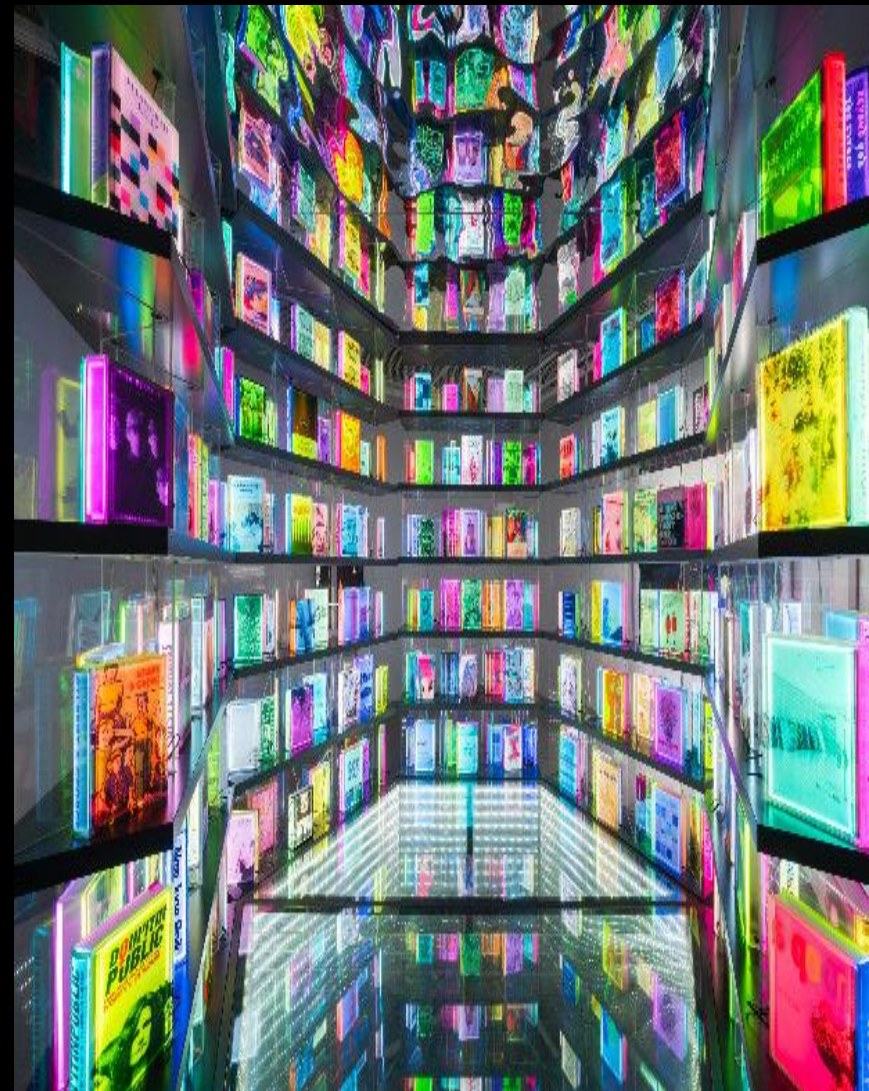
Entrance Installation “Library of Light” by Airan Kang