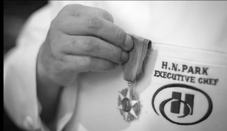
He was the first Korean chef to be awarded the Order of Agricultural Merit