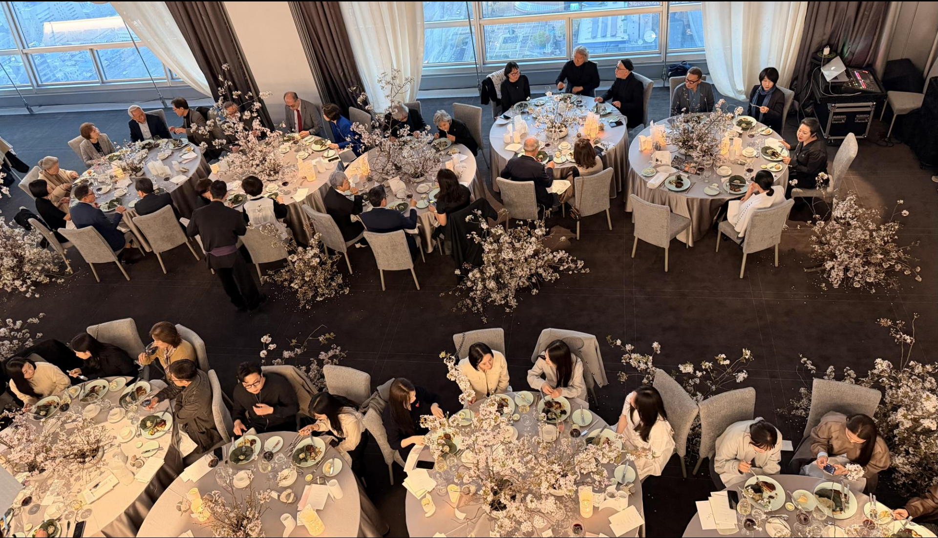
Spring Decoration with Cherry Blossom